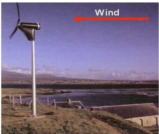
Figure 3 Downwind Mill