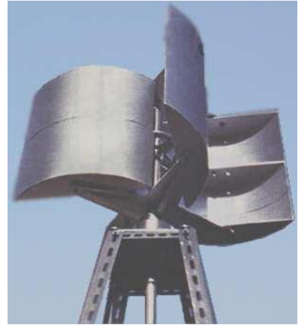
Figure 6 Savonius Wind Mill

The Giromill Turbine is a special type of Darrieus Wind Turbine. It uses the same principle as the Darrieus Wind Turbine to capture energy, but it uses 2-3 straight blades around the vertical axis to minimize the pulsating torque.