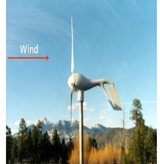
Figure 2 Upwind Wind Mill

The upwind turbine is a type of turbine in which the rotor faces the wind. A vast majority of wind turbines have this design. Its basic advantage is that it avoids the wind shade behind the tower. On the other hand, its basic drawback is that the rotor needs to be rather inflexible, and placed at some distance from the tower. In addition, this kind of HAWT also needs a yaw mechanism to keep the rotor facing the wind.