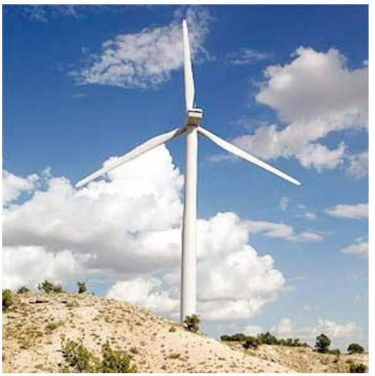
Figure 1 Horizontal Wind Mill

The horizontal wind turbine is a turbine in which the axis of the rotor is parallel to the wind stream and the ground. Most HAWTs today are two- or three-bladed, though some may have fewer or more blades.